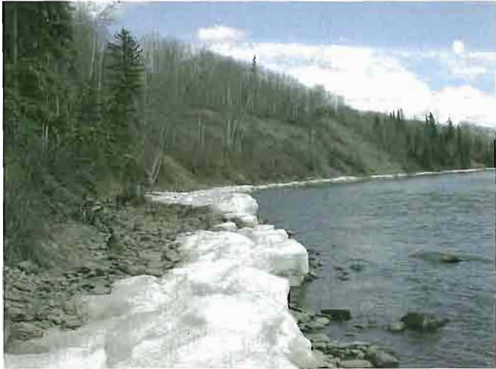
Photo 45: View upstream from toe of landslide area towards uniform erosion slope below Harris Auto Wrecking site.