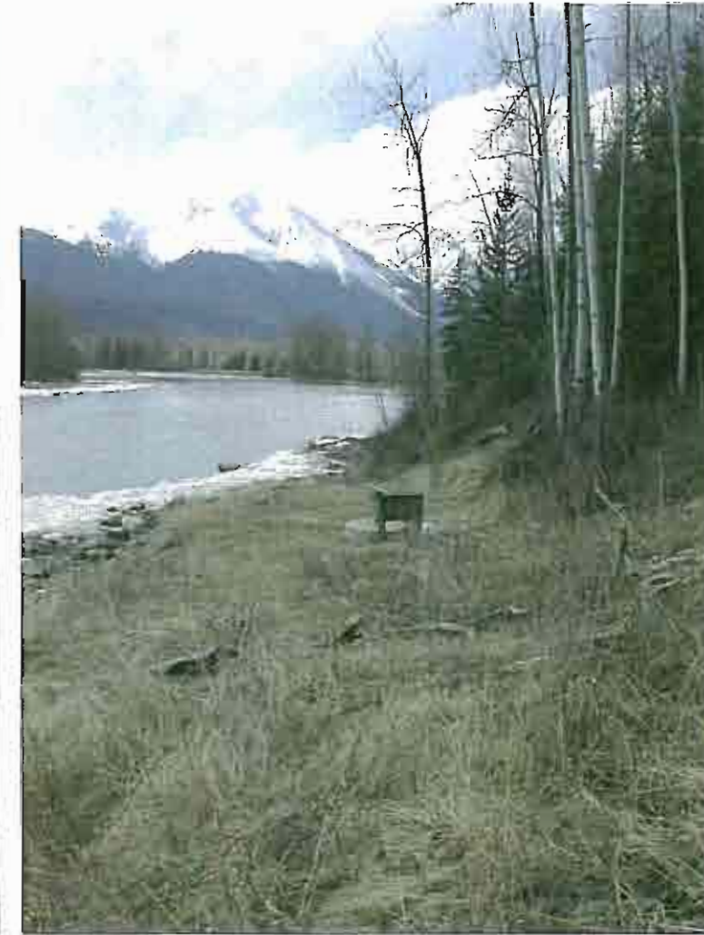
Photo 44: Local community well located on river bank at toe of slope below 265 Lower Viewmount Road.