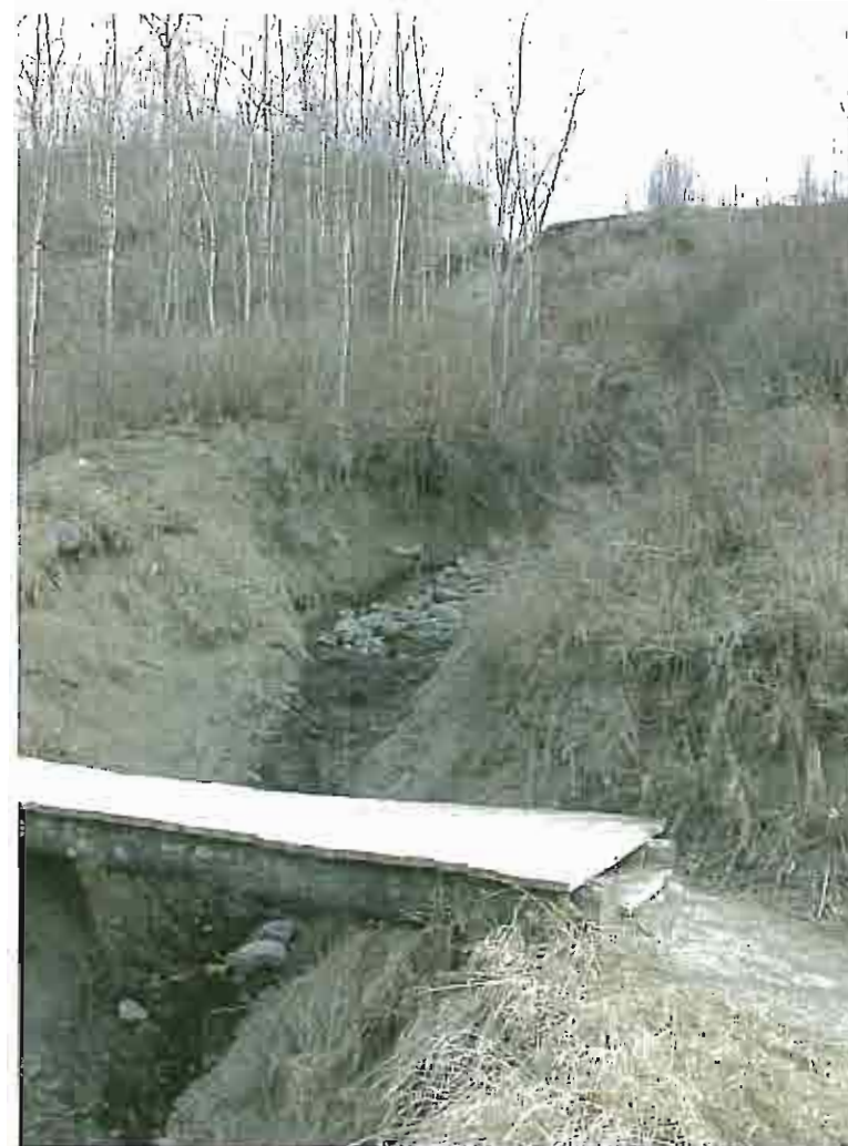
Photo 56: Looking upslope across old access road at erosion gully on slope below 559. Bedrock exposed in lower portion of gully.