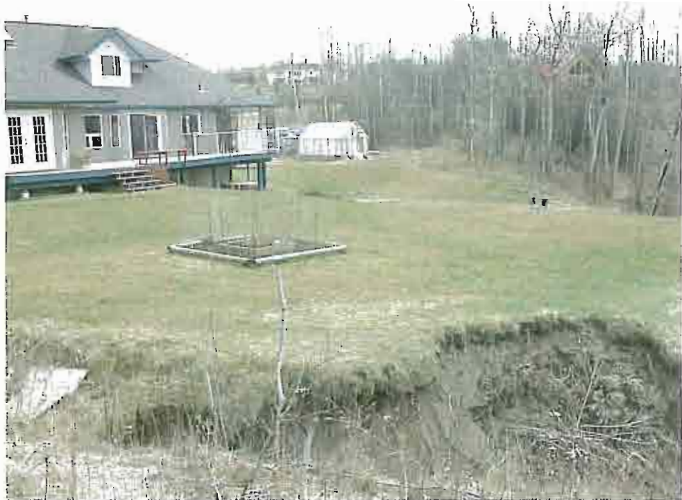
Photo 54: Erosion at crest of old river valley slope, behind 559. Drainage from pond area (Photo 53), enters from left foreground.