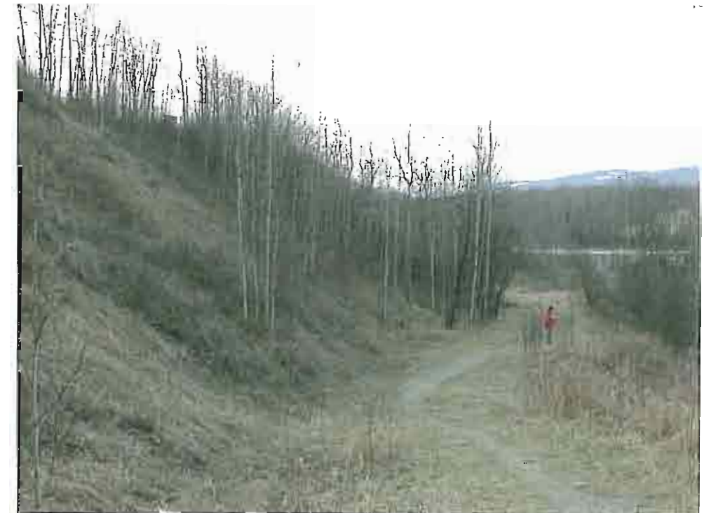
Photo 50: View south at old cuts and fills along old access road, on old river valley slope below 661.