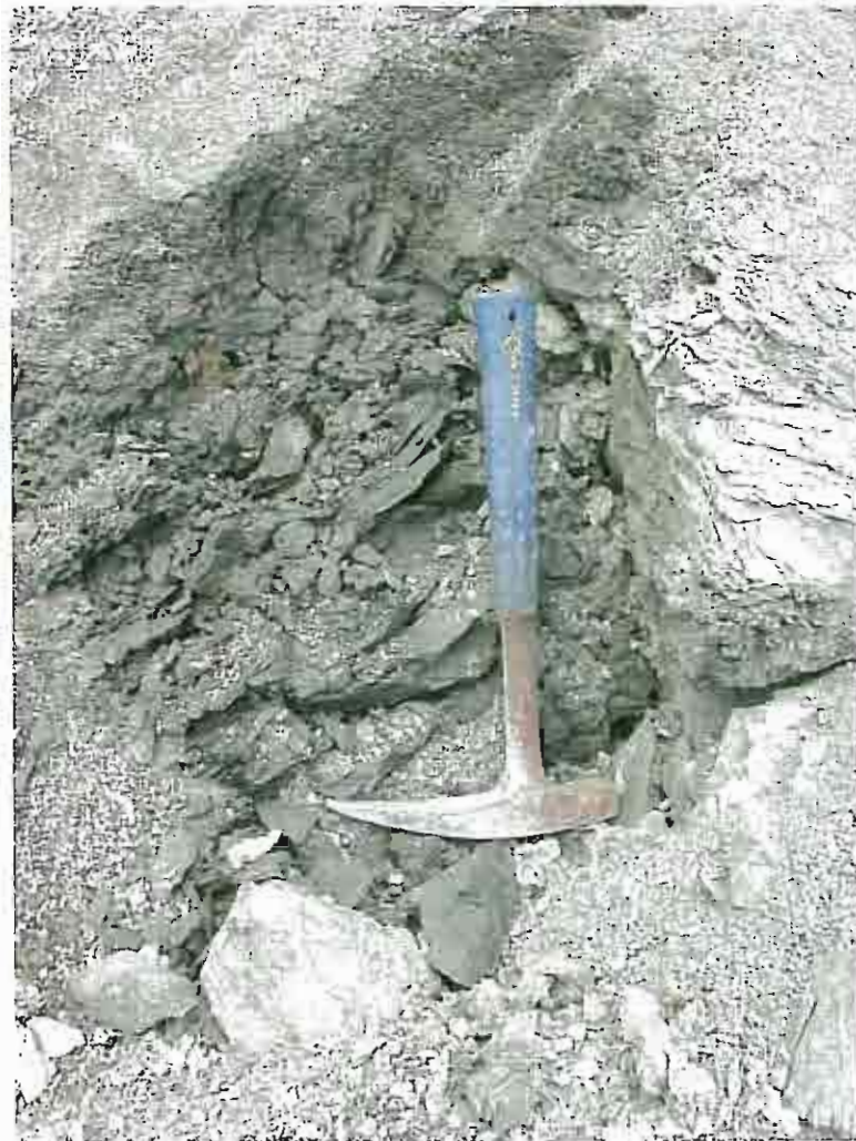
Photo 42: High plastic clay with some interbedded silt seams, exposed along river bank at toe of slope.