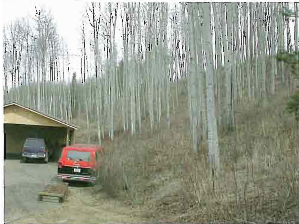
Photo 61: View north along uppermost portion of old river valley slope at rear (east side of 882).