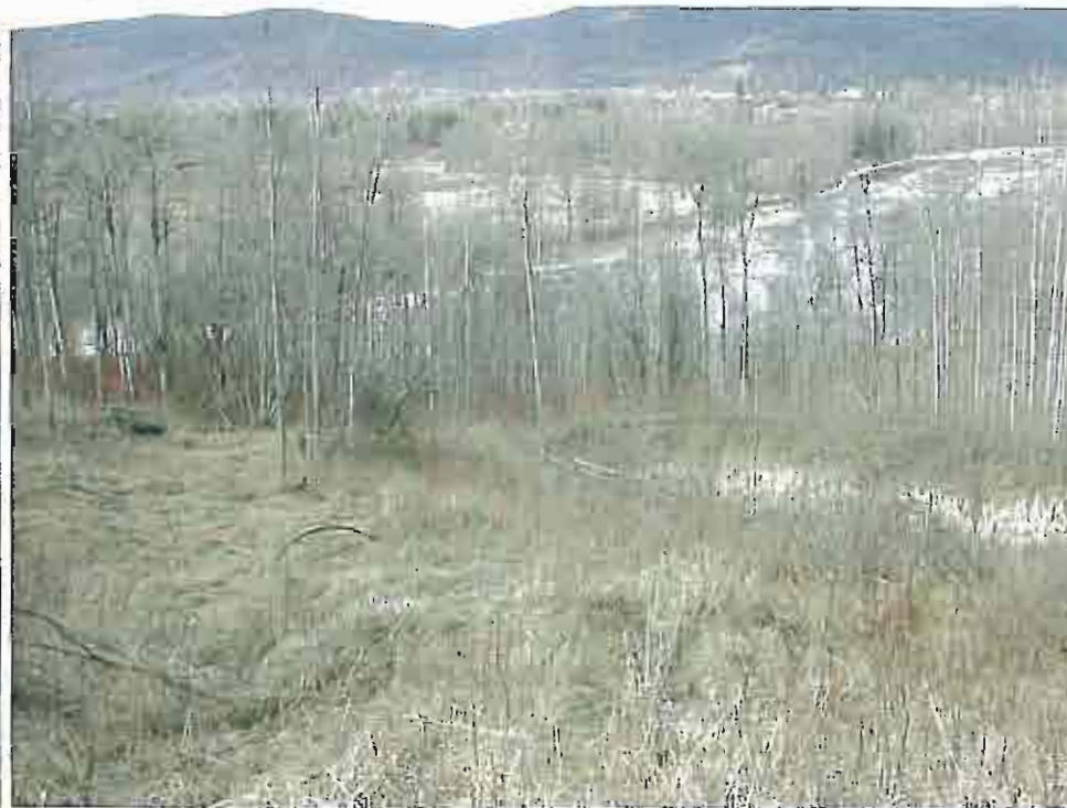
Photo 33: View south at lagoon constructed on bench (graben?) on slope below 559.