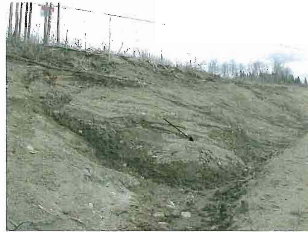
Photo 64: Failure of access road cut slope, constructed in wet, soft clay till soils at east side of Lot 1 Plan 11141.