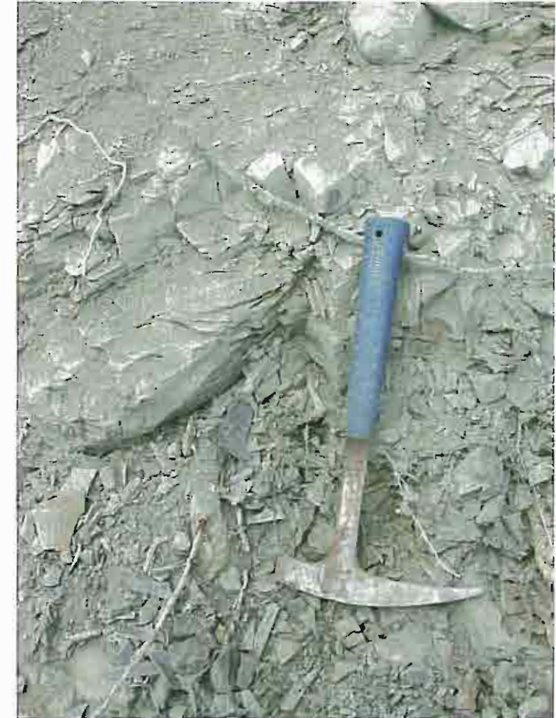
Photo 48: Close up of bedrock exposed on eroded slope below Harris Auto Wrecking site (dark grey siltstone and shale, dipping out of slope at approximately 30 degrees).