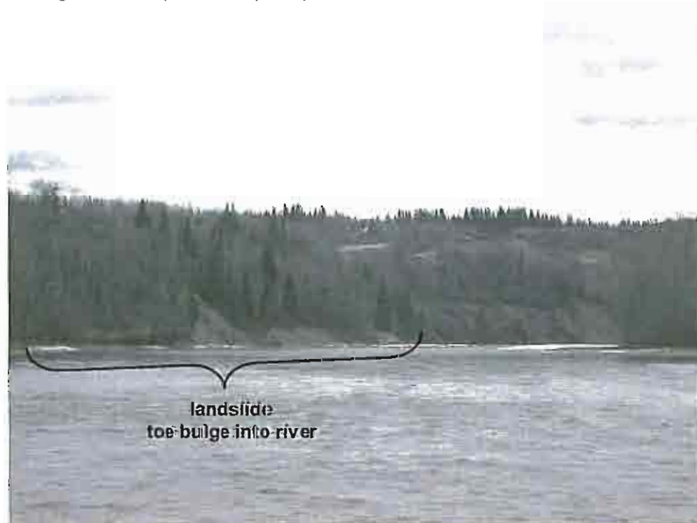
landslide toe bulge into river