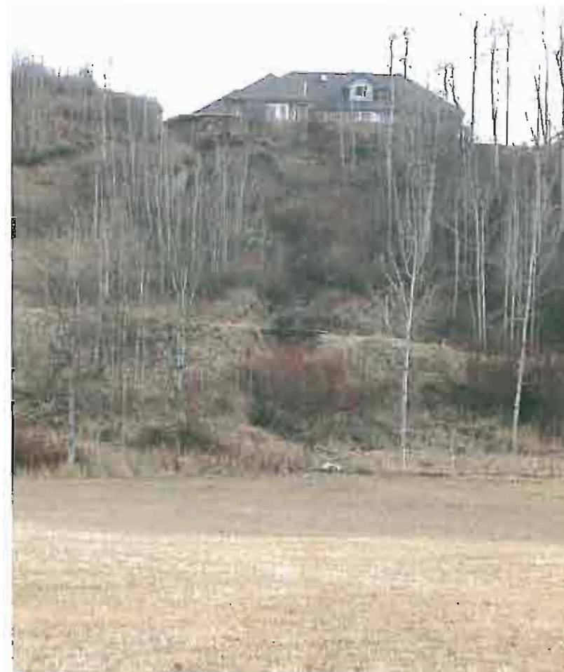
Photo 52: Looking north east at 559 and erosion gully down old river valley slope and across old access road.