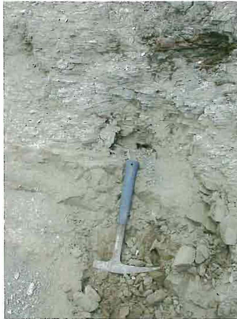
Photo 43: Silt and sand overlain by high plastic clay, exposed along river bank at toe of slope.