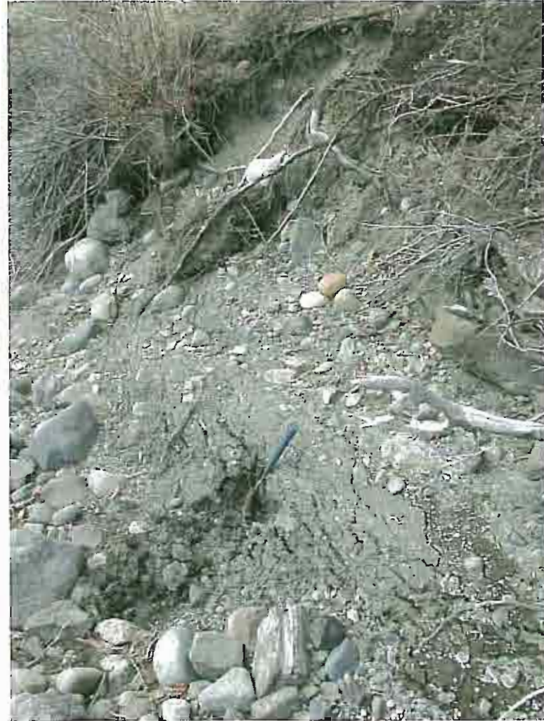
Photo 38: Close up of toe thrust ground movement along river bank, in soft, wet high plastic clays, below 195 Lower Viewmount Road.