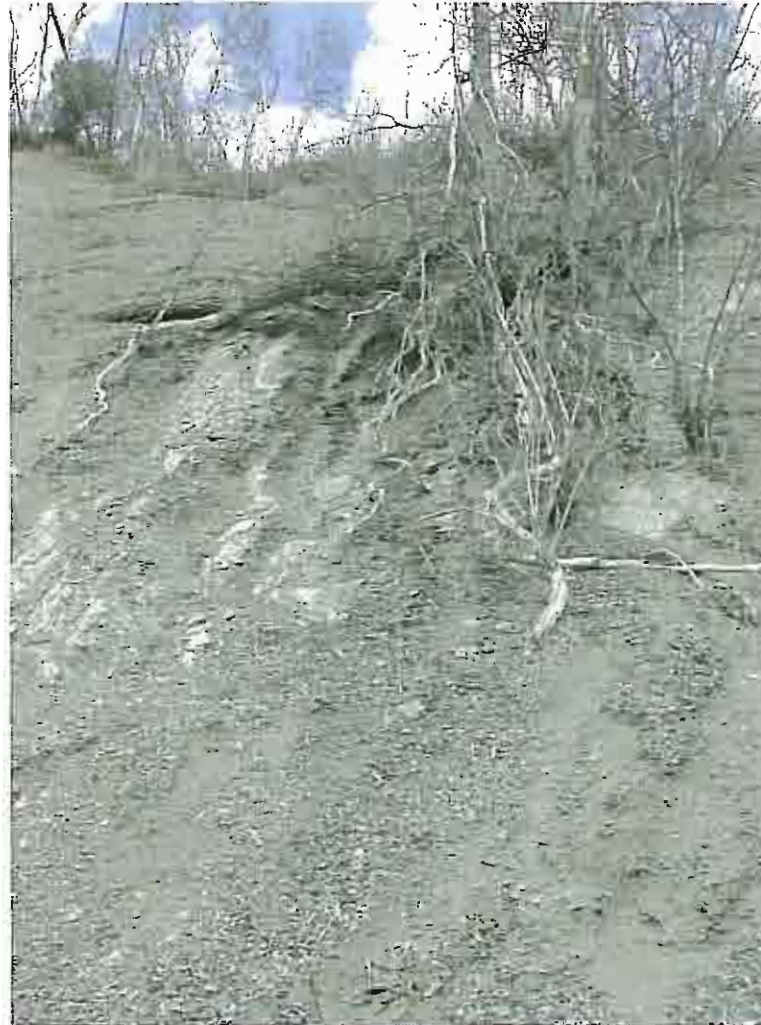
Photo 47: Bedrock outcrop on steep eroded slope below Harris Auto Wrecking site.