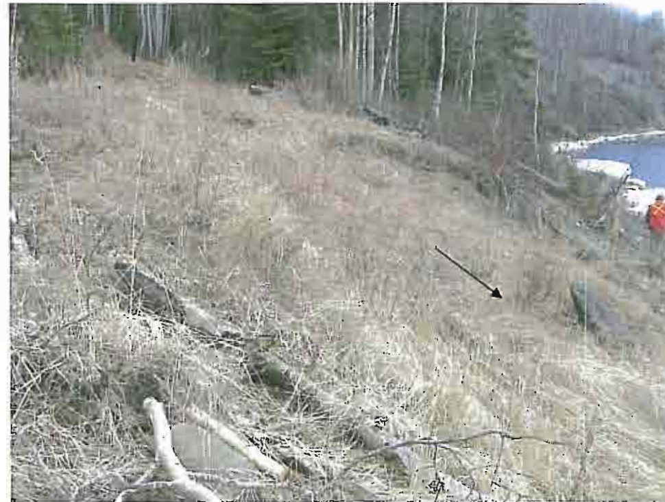
Photo 40: Evidence of recent ground movements along river bank below 265 Lower Viewmount Road.