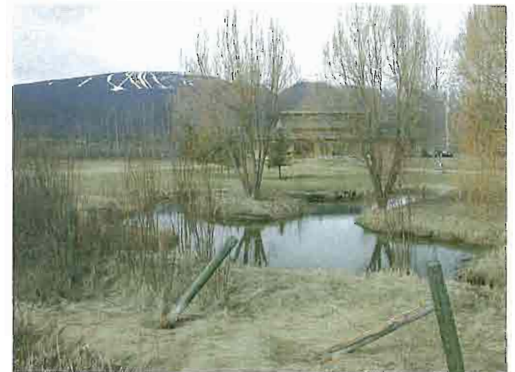
Photo 53: Drainage pond area above old valley slope between 559 and 661.