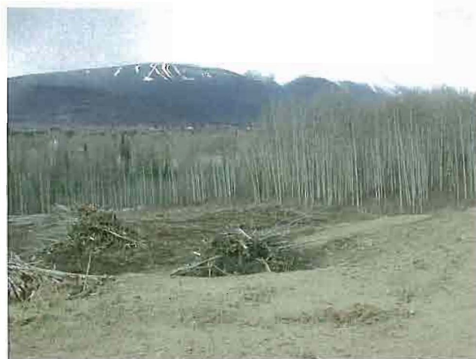
Photo 63: View west across recently cleared Lot 1 Plan 11141, located immediately south of Harris Auto Wrecking site.