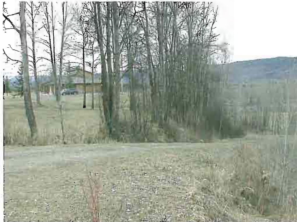
Photo 49: Looking south west at intersection of old access road down old river valley slope with Lower Viewmount Road, just north of 661.