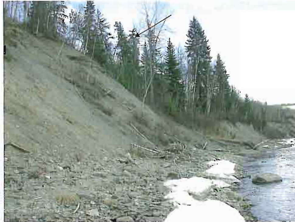
Photo 39: View upstream at toe thrust area along Bulkley River below 355 to 485 Lower Viewmount Road. Note eroded slopes and back tilted trees.