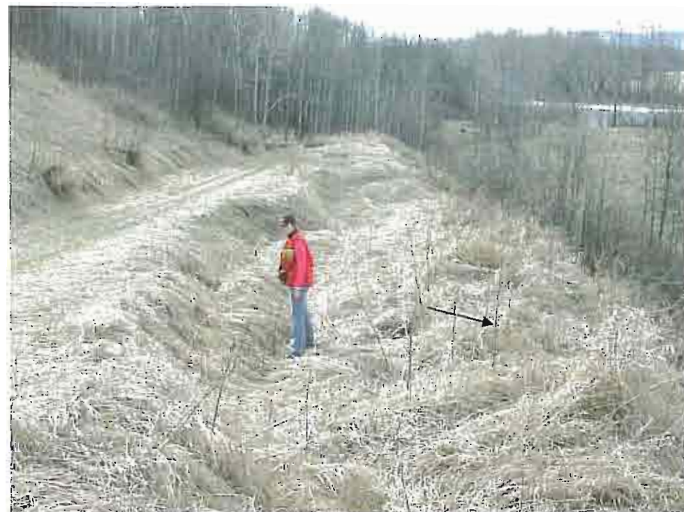
Photo 51: View south at fill failure on old access road, below 661.