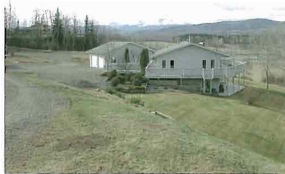
Photo 59: Typical cut and fill house site development on bench in old river valley slope (House at 825 looking south).