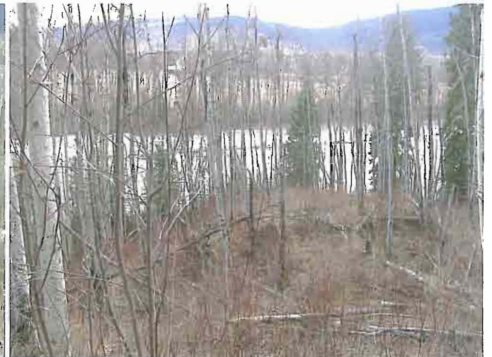
Photo 34: View south west at typical hummocky, ridged landslide terrain on slope below 355 to 485.