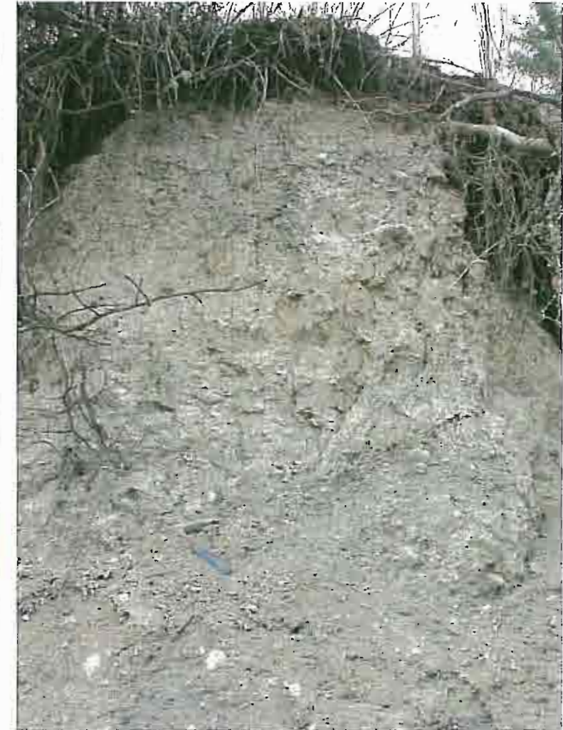
Photo 41: View of clay till exposure on displaced slide block exposed along river bank.