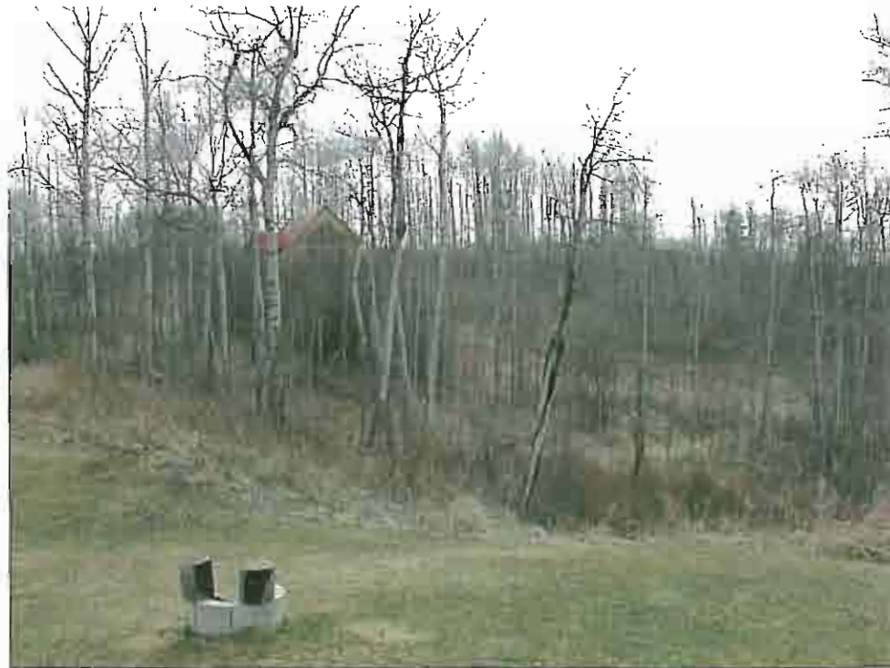
Photo 32: View east from 559 towards 485 across what is interpreted to be the possible northwest end of the main scarp of the landslide. Septic lagoons for 485 and 559 are on slope to right of photo.