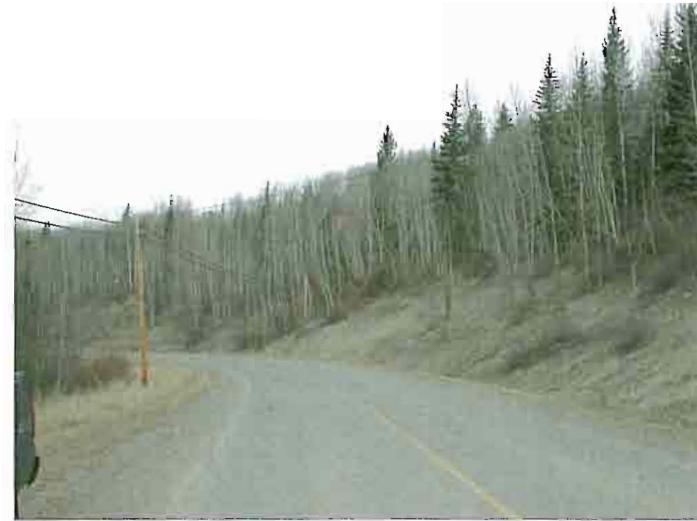
Photo 62: View north at cut slope on old Viewmount Road, subject to some surficial sliding, soil creep and erosion.