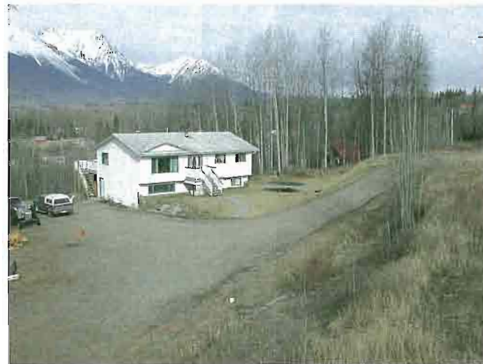
Photo 60: View west at cut and fill house site development on old river valley slope (House at 895).