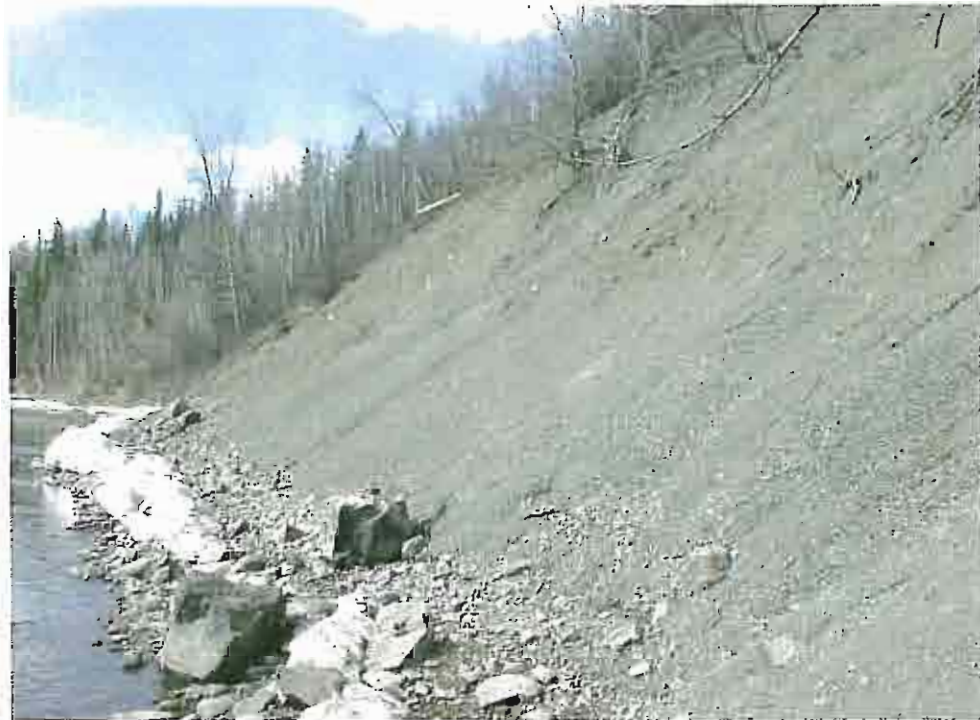
Photo 46: View downstream at steep eroded river valley slope below Harris Auto Wrecking site. Soil appeared to be colluvium derived from clay till with some sand and gravel, overlying bedrock.