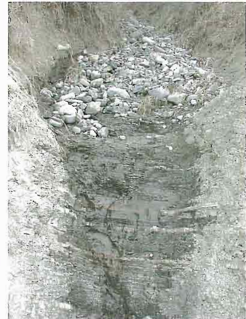
Photo 57: Bedrock (shale, siltstone, minor sandstone), exposed in erosion gully below 559 just above old access road.