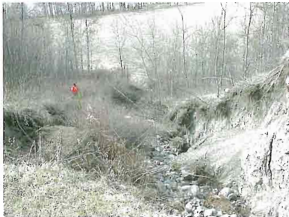
Photo 55: Looking down erosion gully from crest of slope at the rear of 559. Note recent sliding of undercut slopes.