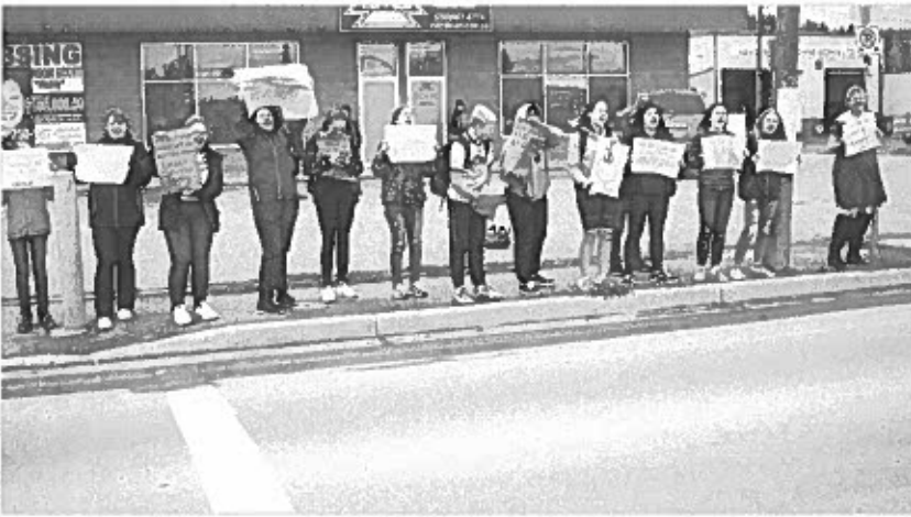
NVSS students participate in the Global Climate Strike on Sept. 27, 2019.